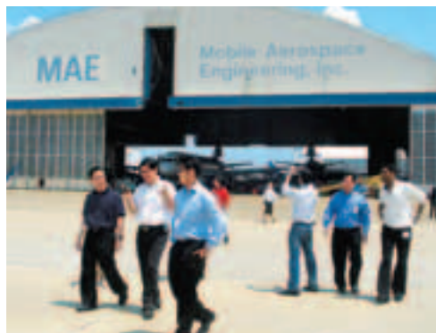
Analysts visiting MAE, the Group's US Airframe MRO facility in Mobile, Alabama.