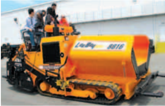
Analysts trying out a commercial class asphalt paver at VT LeeBoy in Lincolnton, North Carolina.