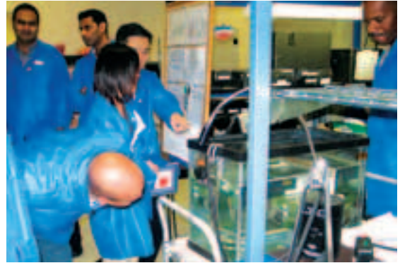
Analysts watching a staff member conduct a stringent water submerging test of a ruggedised computer at VT Miltope in Montgomery, Alabama.