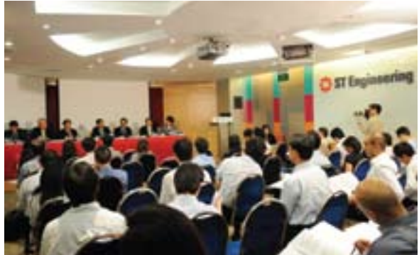
Senior management addressing questions from analysts and media at a quarterly results briefing.