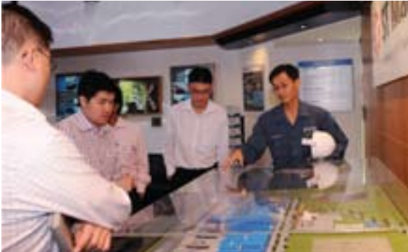
Analysts' visit to ST Marine's Benoi and Tuas yards in December.