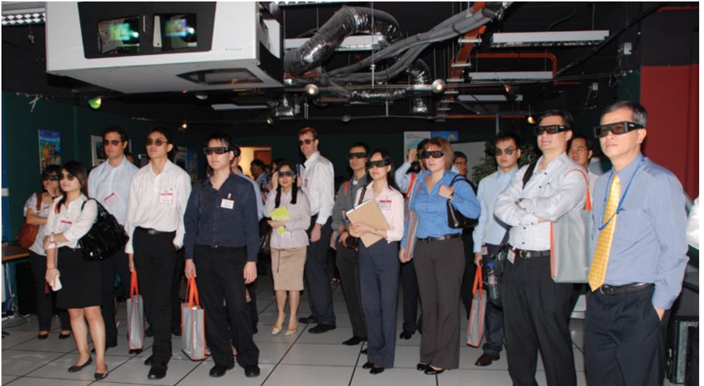
Analysts visiting ST Electronics' 3D theatre.