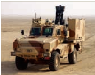
SRAMS on RG31