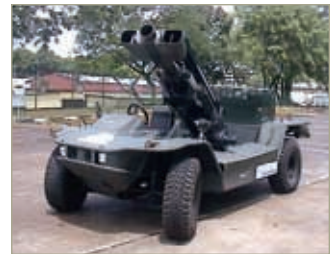
SRAMS on Spider