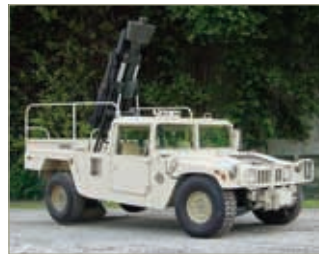
SRAMS on HMMWV