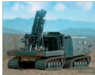
SRAMS on Bronco