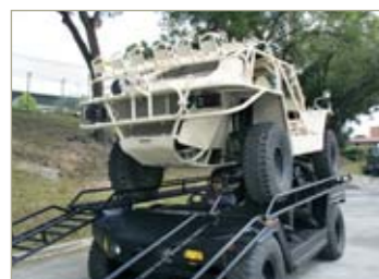
Stacked for C-130 or helicopter portability