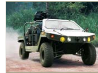
Accommodates various weapon mounts