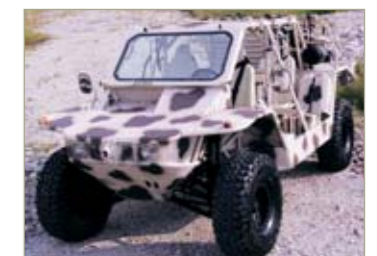
LSV in desert terrain