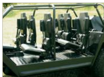
Versatile crew configuration