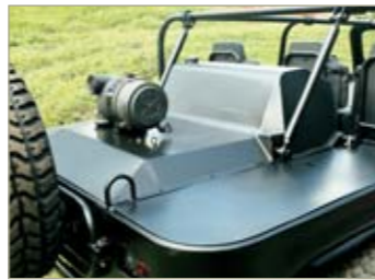
Configurable roll-cage system