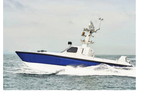
Unmanned Surface Vessels Maritime