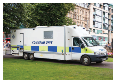
Mobile Command Posts/Vehicles Defence and Public Safety and Security