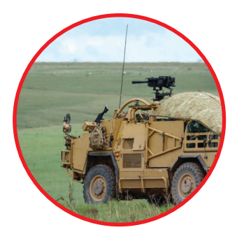
Para-Military and Defence