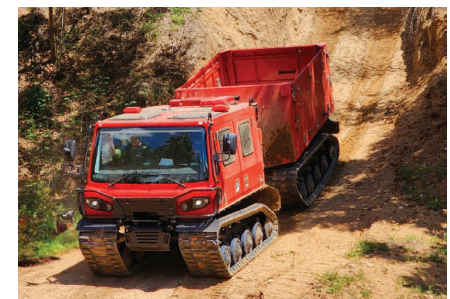
Multi-Purpose Vehicles Humanitarian Assistance and Disaster Recovery