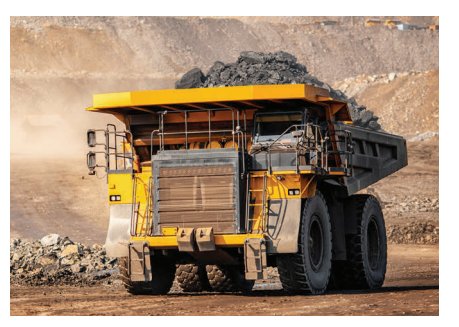
Autonomous Heavy-Duty Trucks Mining