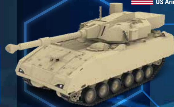
Direct Fire Support Vehicle