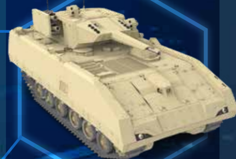
AIFV Anti-Tank Guided Missile