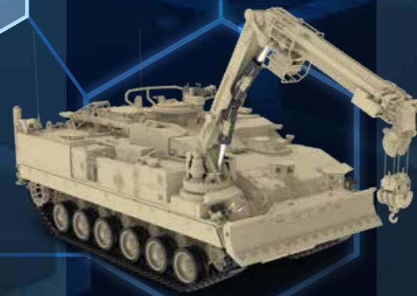
Armoured Recovery Vehicle