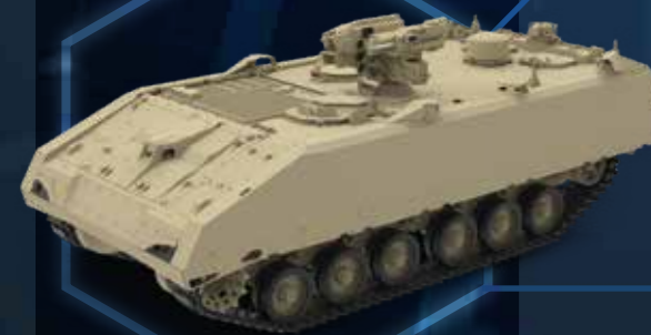
Armoured Command Vehicle