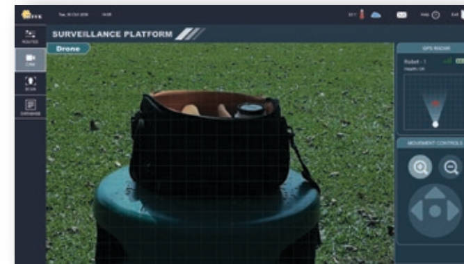
All-round & PTZ cameras for 360° panoramic scan and view