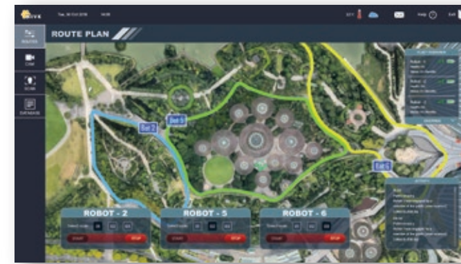
Central Command Centre & Fleet Management