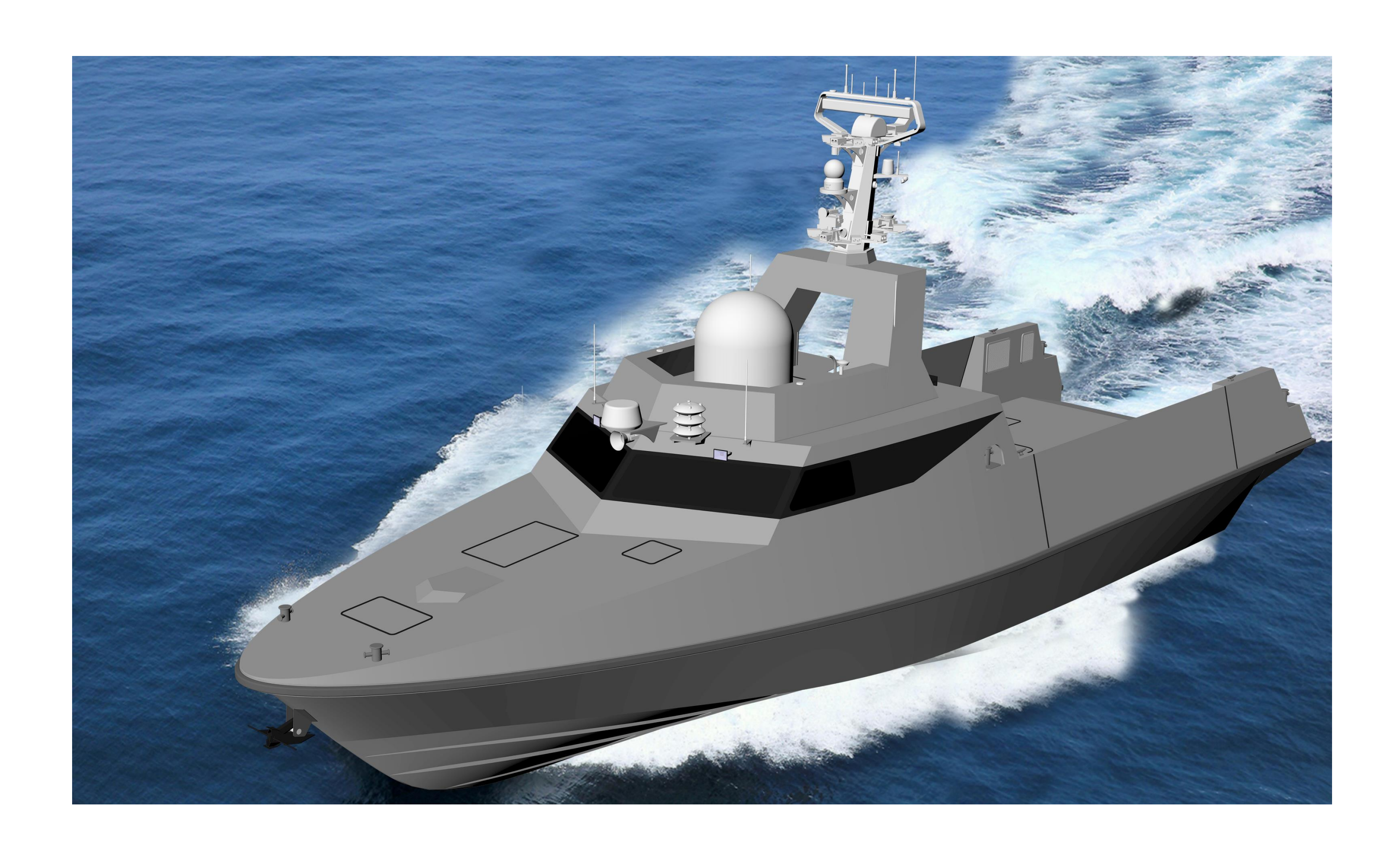
SWIFT 18 UNMANNED SURFACE VESSEL(USV)