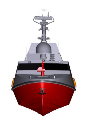
Swift 18 USV – Firefighting & SAR