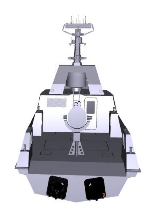
Swift 18 USV – Constabulary