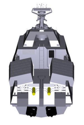
Swift 18 USV - Expendable Mine Disposal System

Payload Up to 5t, 20' container footprint