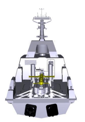
Swift 18 USV – Towed Side Array Sonar